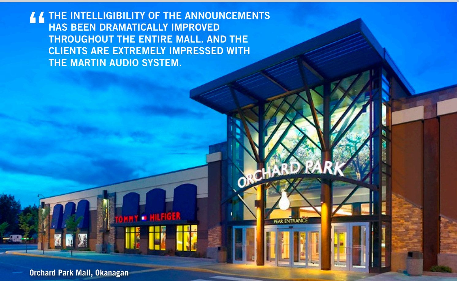
Orchard Park Mall, Okanagan

“THE INTELLIGIBILITY OF THE ANNOUNCEMENTS HAS BEEN DRAMATICALLY IMPROVED THROUGHOUT THE ENTIRE MALL. AND THE CLIENTS ARE EXTREMELY IMPRESSED WITH THE MARTIN AUDIO SYSTEM.”